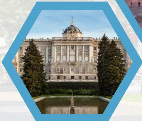
Royal Palace of Madrid

Spread the word! Invite your colleagues and peers to join you at Dental 2025.