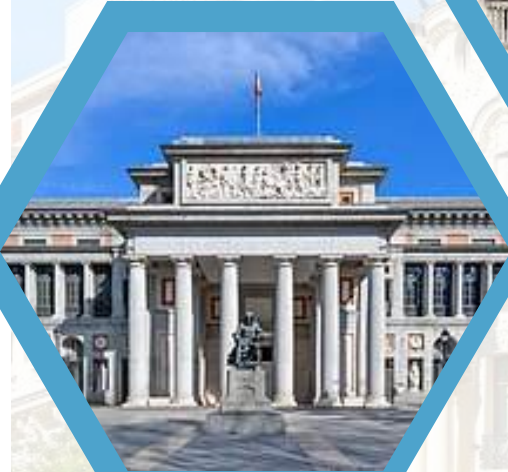
Museo Nacional del Prado

Madrid, the capital of Spain, is a vibrant city known for its rich cultural heritage, stunning architecture, and lively atmosphere. Famous for its grand boulevards, historic landmarks like the Royal Palace and Plaza Mayor, and world-class art museums such as the Prado and Reina Sofía, Madrid seamlessly blends history with modernity. The city's bustling markets, tapas bars, and energetic nightlife make it a hub for both locals and tourists. With its sunny weather and welcoming spirit, Madrid offers a unique experience of Spanish culture, art, and cuisine.